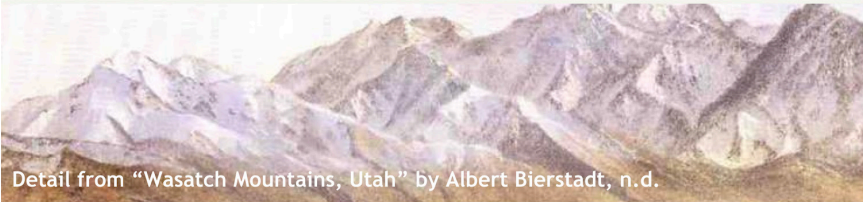
Detail from "Wasatch Mountains, Utah" by Albert Bierstadt, n.d.

Music from the Italian Baroque & some High Baroque Favorites